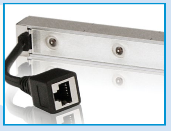
Asset Gateway: Raritan SRC or PX PDU AMS sensor showing port for connection to Raritan's PX or SRC SNMP gateways