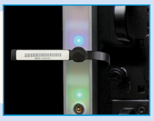
Asset Management Sensor (AMS) Customizable RGB color LED for each 1U space

Asset Management Tag (AMT) AMT asset tag with unique ID chip and bar code with adhesive patch for IT devises.