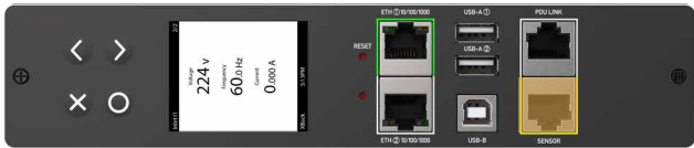
RJ45 Sensor Port on a Controller of a Xerus-enabled Managing Device (Controller designs vary by brand, model, and version)